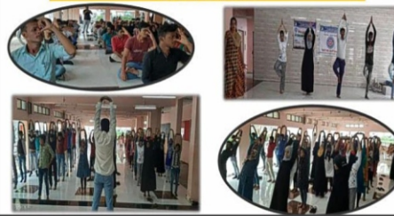
Yoga Day By NSS Unit

SEM'T's M.B. Harris College Of Arts And A.E. Kalsekar College Of Commerce And Management