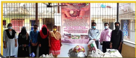
Small Helping Hand Towards Humanity By NSS Unit For Konknan Flood Affected People

SEM'T's M.B. Harris College Of Arts And A.E. Kalsekar College Of Commerce And Management